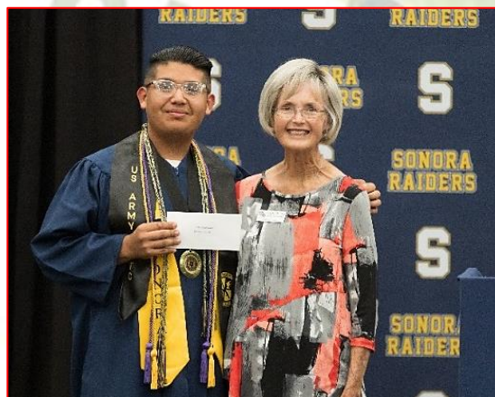
Sonora High School