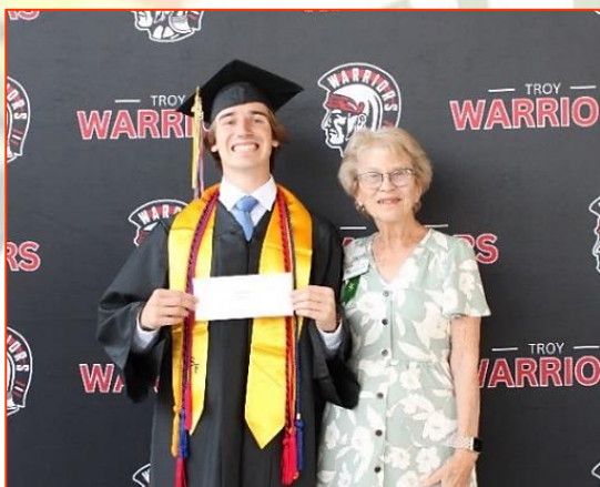
Troy High School

In our last issue, we still had 3 Scholarships to be awarded. Here are the recipients from Troy and Sonora High School. Unfortunately, we were unable to get a photo of the Buena Park recipient.