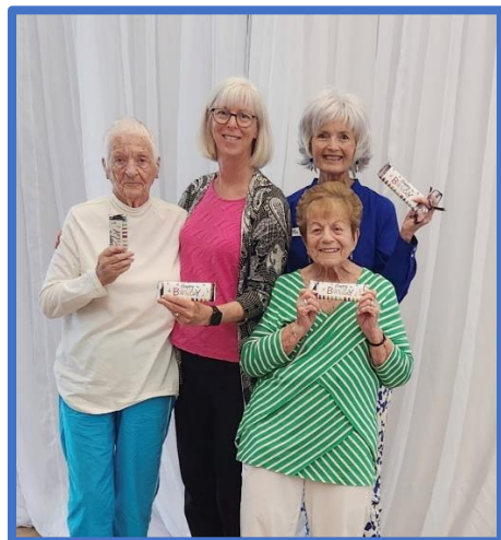
Happy Birthday to some of our June and July ladies from the General Meeting

At the end of the program, our Club donated a check to the Muck.